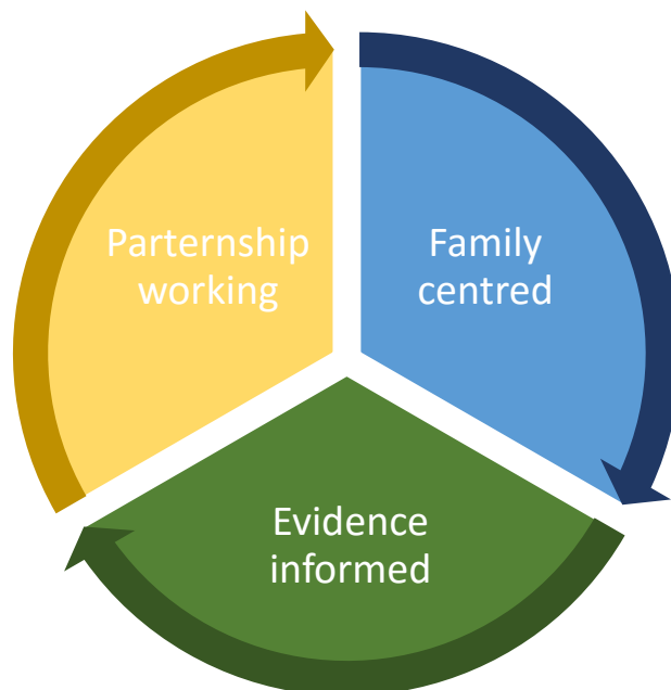
Figure 2 Assumptions underpinning the Paving the Way project

As shown in the project logic model in appendix 1 and in Figure 2, the project’s approach was family centred, evidence informed and grounded in partnership working. These were seen by the project team as principles underpinning the work of the project, as well as principles to promote to support effective service commissioning and delivery. The evaluation found that the project very much ‘did what it preached’ and was consistent in applying these principles to its work. These were also seen as principles underpinning the work of the CBF, and it was evident that in respondents’ mind the project and the CBF were one and the same, the distinction between the two was somewhat artificially imposed by the requirements of the evaluation brief which was to assess the work of the project, rather than the CBF as a whole.