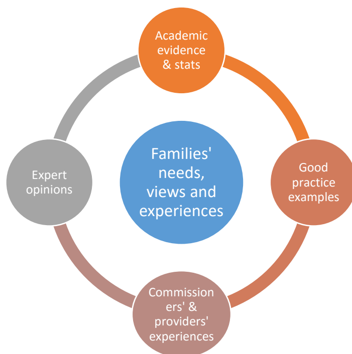
Figure 3 Data sources informing the Paving the Way project evidence base

The evaluation found that data gathering did not consist of a one-off exercise, it was an iterative process with regular opportunities for different stakeholders to comment on the emerging evidence base, and the conclusions and recommendations drawn from this evidence. For example, while a series of workshops were run at the start of the project to gather evidence on what good services look like, there were other opportunities later on for carers, professionals and experts to comment on how this evidence was used to develop resources targeted at different groups.