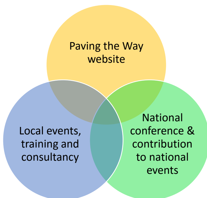
Figure 4 Disseminating learning to service commissioners, providers and professionals

The evaluation findings show that these mechanisms for disseminating the project resources were viewed as effective. What it is much more difficult to determine within the scope of this evaluation is how many of the 1000s of people involved in commissioning and delivering local services were accessing the project resources.