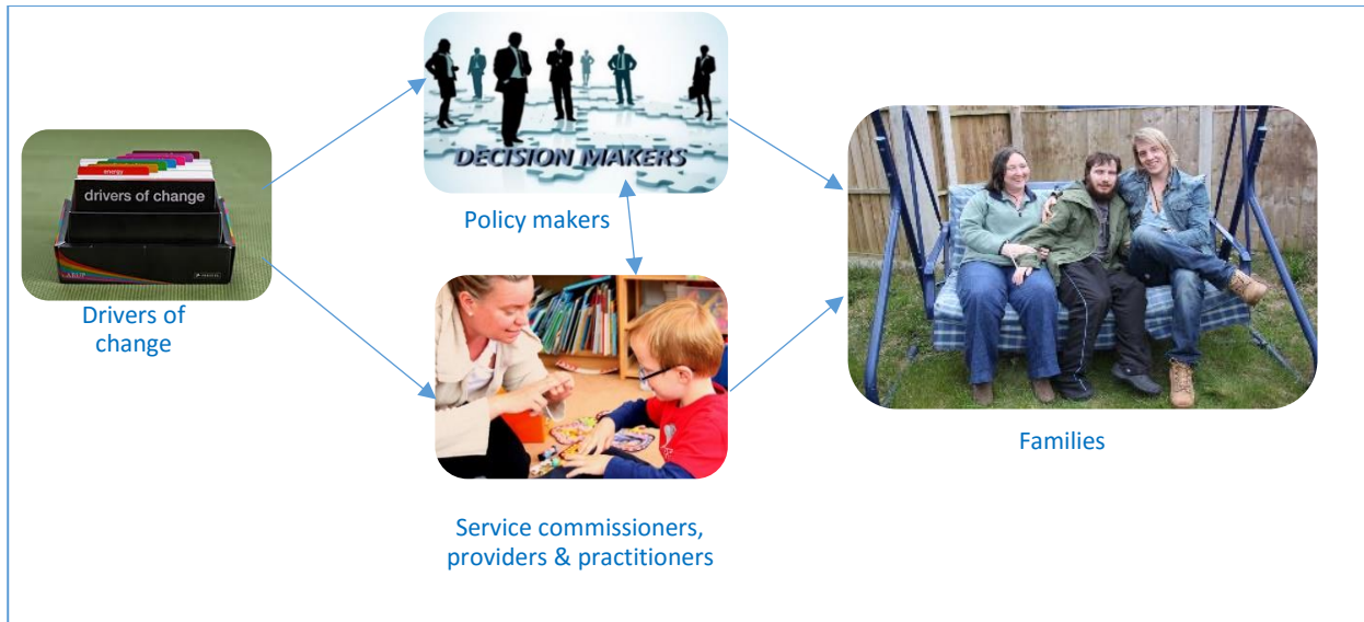
Figure 1 Paving the Way stakeholder groups