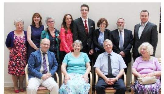
Families attending the APPG