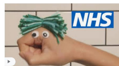
How to wash your hands NHS song | NHS ... youtube.com

Try using a song you know your relative enjoys and pairing the song with the handwashing each time to make it a fun experience.